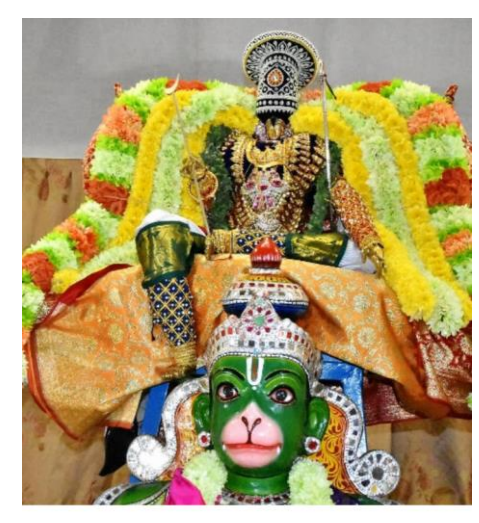
Sri Rama Navami 25th March