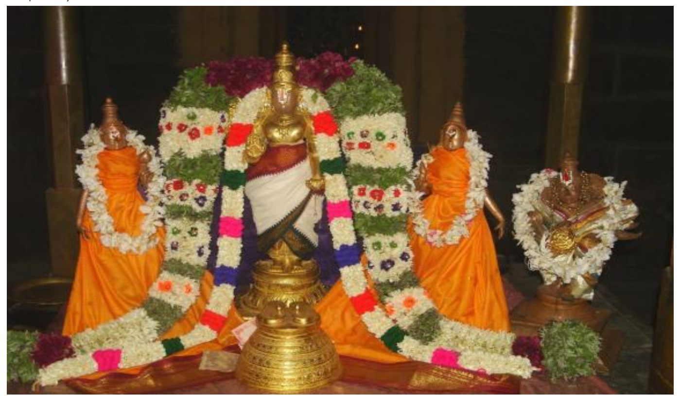
mAyakkUththan and nammAzhwAr

There is a big pond in this dhivya dhEsam, so the place is also known as perunguLam (big tank/pond).