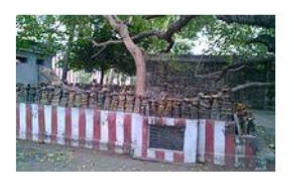
ashwattha tree with snake idols

performed a sacrifice here seeking a boon from the perumAL for a male child and got four sons with Rama being the eldest after he gave the milk pudding to his three wives. In view of such a belief, childless couples visit here, take a bath in the sea, establish a snake idol under the ashvattha tree, worship the lord and consume the milk pudding hoping they would get progeny. It is believed that Rama came here and waited for three days after praying to the ocean god VaruNa to calm the seas to facilitate building a bridge across the sea. During the three days he slept on a bed of grass thereby causing the name dharbashayanam. After building the bridge Rama worshiped the perumAL and the perumAL gave a divine bow to Rama with which he fought and killed RAvaNa. This shrine also has gained the moniker "saraNAgathi kshEtram" (sanctuary) as a result of the belief that Rama gave refuge to VibheeshaNa at this place. In addition, he gave refuge to two of Ravana's agents who came to spy on the strength of Rama's monkey brigade and who later sought refuge. In the shayanarAma sanctum there are images of VibheeshaNa, the two spies, VaruNa and VaruNi too.