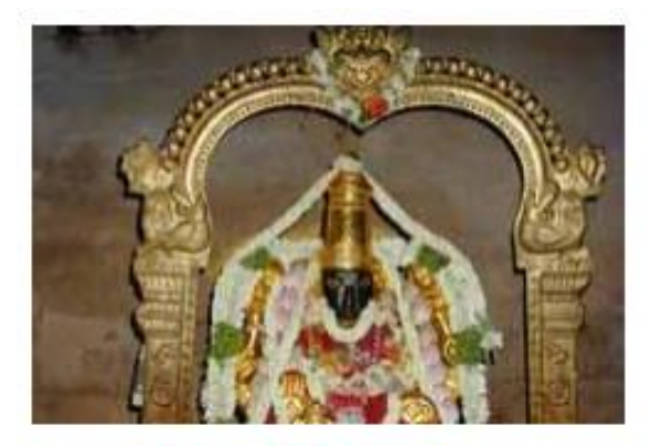
Rama in reclining posture