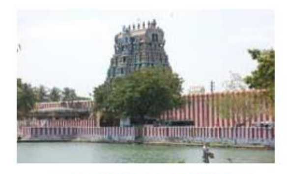
Temple tank (cakra tIrttam)

Temple Details: The presiding deity is called Adi JagannAtha perumAL () in a seated posture facing the east, with Sridevi and BhUdEvi idols on either side. The festival idol goes by the name KalyANa JagannAtha (). The goddess in a separate sanctum has two names: KalyANavalli and PadmAsani (,). The crown structure over the sanctum has the name KalyANa vimAnam (), and the temple tank has two names: cakra tIrttam () and hEma tIrttam. (). The adjacent sea is also considered sacred and has the name ratnAkara tIrttam (). The resident temple tree located behind the back of the sanctum is an ashvattha tree (Ficus religiosa;, ,). KumbAbhishEkam (samprOkshaNam) was conducted in 2002. Six daily worship services are conducted. The temple is open from 7 Am to 12 noon and from 3:30 PM to 8:30 PM.