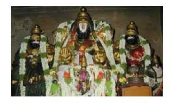
AdijagannAtha perumAL with SridEvi and BhUdEvi

RAmanAthapuram royal family and the accounts audited by the HR & CE department of the government of ThamizhnADu.