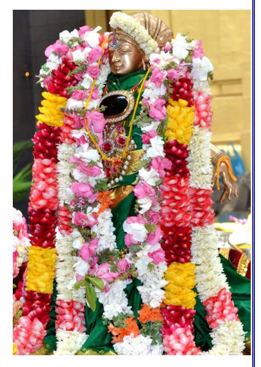
Note the date in Feb

Please email sydneyandal@gmail.com for any feedback or comments